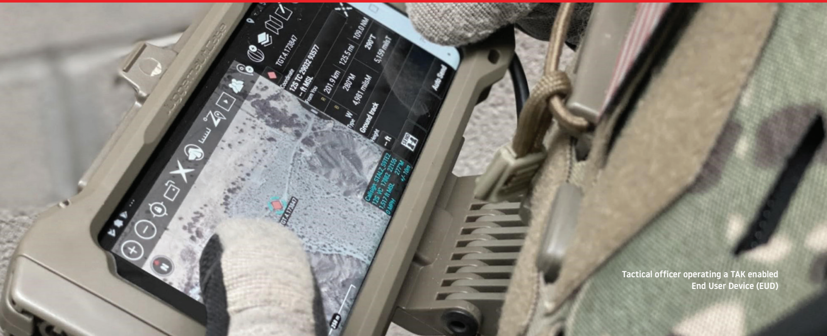
Tactical officer operating a TAK enabled End User Device (EUD)